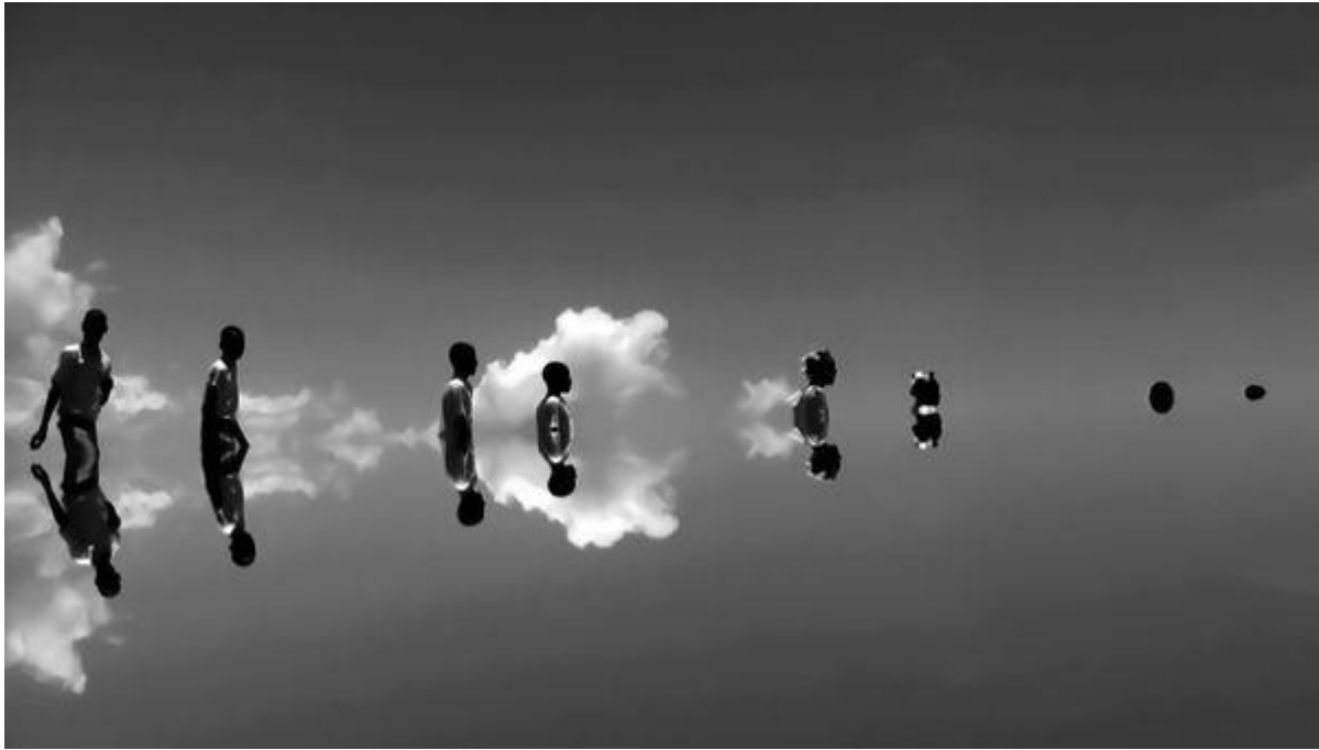
Jeannette Ehlers: Black Bullets (video with sound), 2012. JEANNETTE EHLERS/COURTESY OF JEANNETTE EHLERS

The Fragments of Memory show at the Art Gallery of Ontario was filled with big, impressive works of contemporary art by the Caribbean diaspora and Black Bullets was one to stop viewers in their tracks. Created by the Trinidadian-Danish artist Jeannette Ehlers in 2012, it featured a giant video panel playing a four-minute loop that shows a line of Black school children reflected in clouds. As they walked across the sky, they merged into their mirror images until they disappeared, as though sinking from sight in deepening water. It was a haunting image confronting the viewer with the tragic disposability of young Black lives.